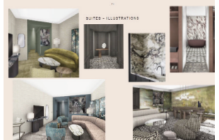
1 Bedroom Suites 760-820/Sf

No Bed Removal | Check-In Time starts at 3:00pm