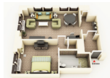
On The Ave Suite