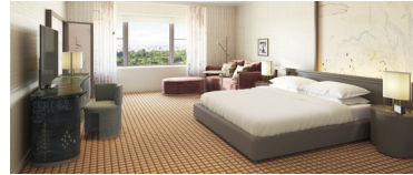
Studio Suite 500/sf