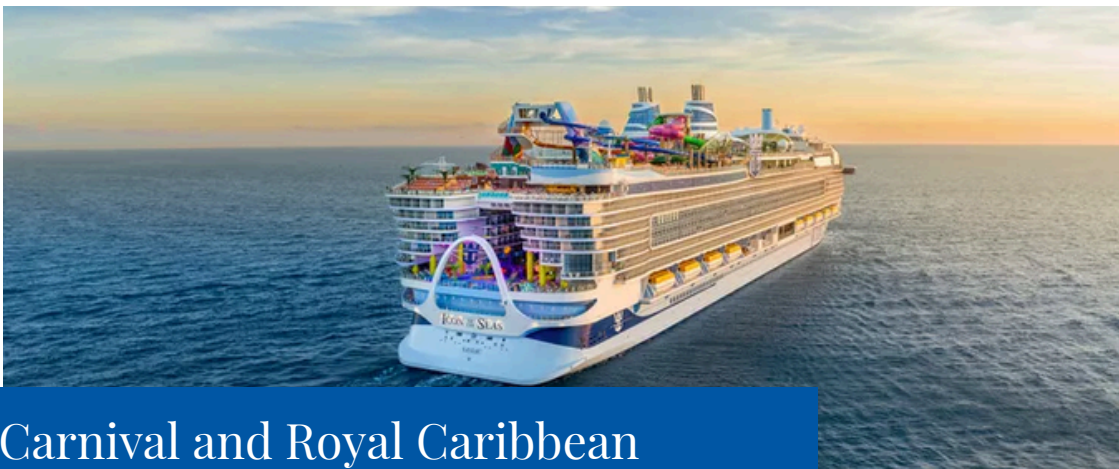
Carnival and Royal Caribbean