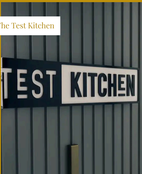
The Test Kitchen

A place for experimental tasting menus, offering bold and unique dishes in an innovative setting. Perfect for those who love to try something new.