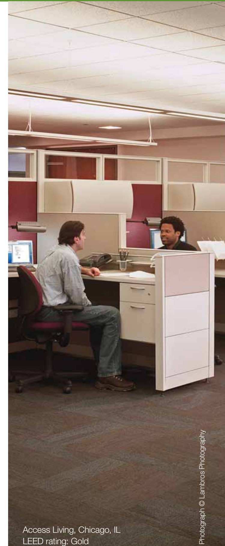
Access Living, Chicago, IL LEED rating: Gold