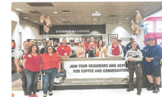
Unwavering support for staff, businesses, schools and first responders