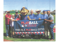
East Valley Mayors celebrating kids!