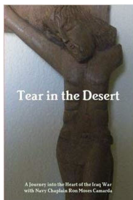
Tear in the Desert

On Sale Now on the St. Monica Webpage or in the Parish Gift Shop