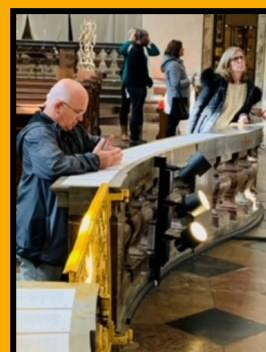
Praying before the Infant of Prague