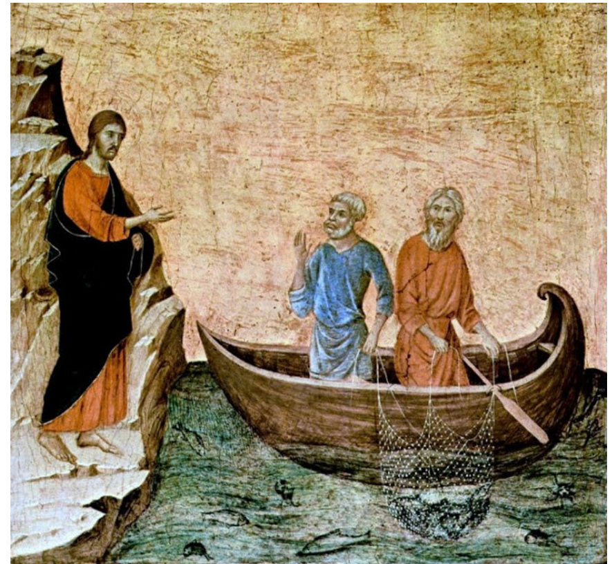
Buoninsegna di Duccio (d. 1319)

Text: Based on Micah 6:8 and Matthew 7:7. Text and music © 1985, Carey Landry and OCP. All rights reserved.