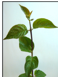
Red Osier Dogwood