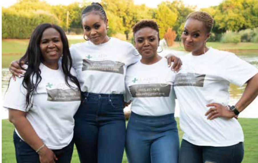
The Gladics Team