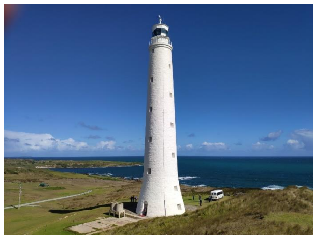
Cape Wickham Lighthouse