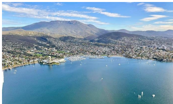
Hobart and Mount Wellington