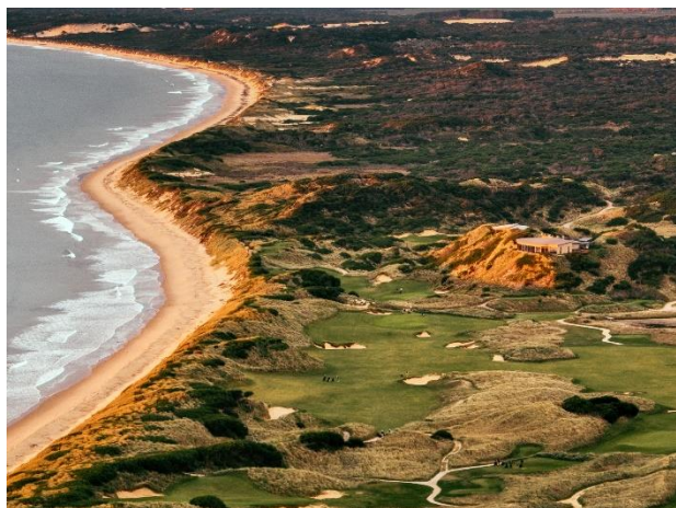
Lost Farm Restaurant