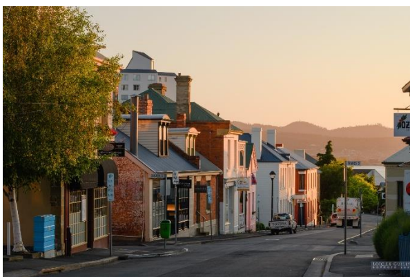
Battery Point, Hobart