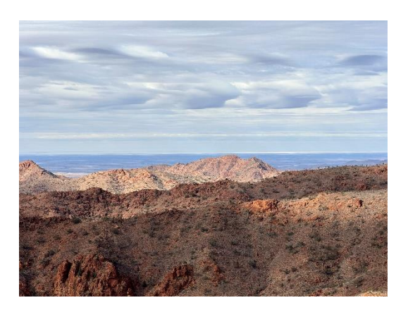
Lake Frome, Arkaroola Ridgetop Tour

There will be an opportunity on the Arkaroola rest day to take the half day Ridgetop tour.