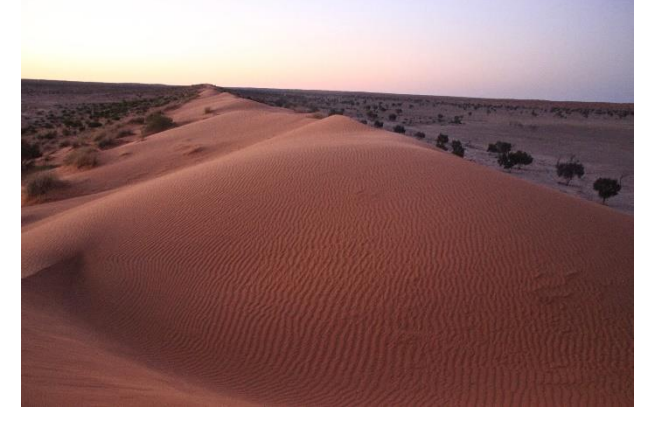
Big Red Sandhills, BIrdsville