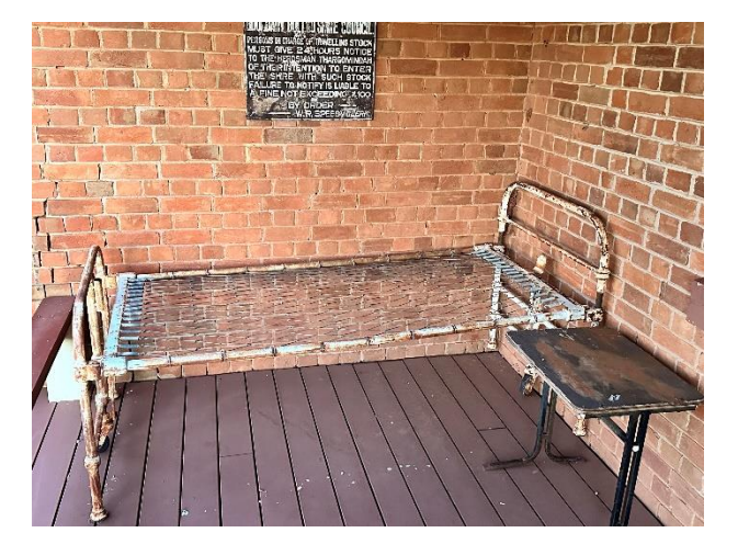
Verandah Wing, Old Thargomindah Hospital (1888)