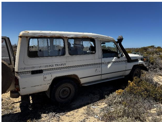
Troopy to explore Flinders Island