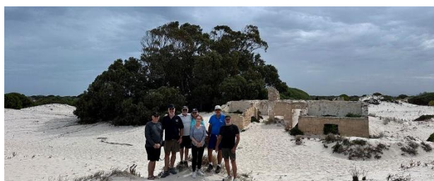
Eucla Telegraph Station Ruins