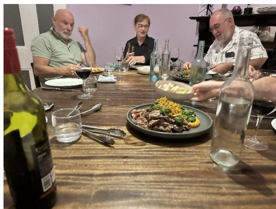
Watervale Hotel Dinner

After a hearty breakfast, it is time to say good-bye to your fellow travelers and set off for home.