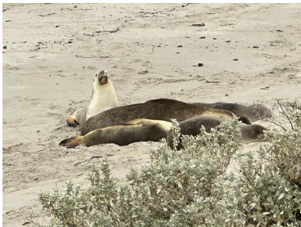
Sea Lions at Seal Bay, Kangaroo Island

There are many photo opportunities here Cape du Couedic Lighthouse, the surreal shapes of the Remarkable Rocks, and the Admirals Arch an impressive rock arch weathered over thousands of years, but also home to a colony of long-nosed fur seals.