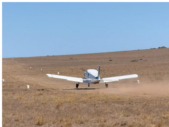
Departing Flinders Island