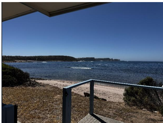
Groper Bay from Accommodation

Flinders Island, at 3,642 hectares, initially had a sealing camp in the 1820s. It also had a whaling station, but by the early 1900s, sheep, horses, cattle, milk thistles, and oats were introduced to Flinders Island, presumably by Willie Schlink and his family.