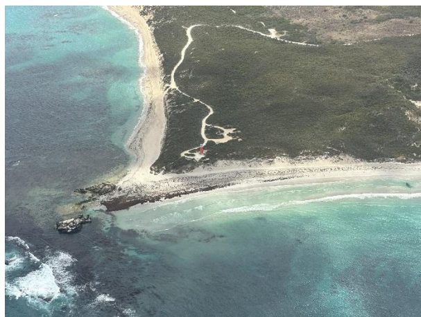
Cape Banks Lighthouse