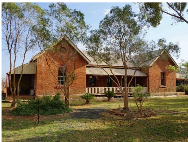
Old Thargomindah Hospital (1888) made from mud bricks