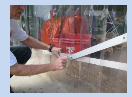
1. Locate pair of pre-perforated holes in two center slats of a 50" PARTAY Panel. Push Weight piece, with protruding studs, center stud, thru the two holes with the stud facing away from the garage door. Place the Weight piece with holes only, center hole, over the center stud and loosely secure a wing nut on the center stud.

One Wind Weight Kit for a 50 inch wide PARTAY Panel has a two piece Wind Weight, 3 wing nuts and Two Laminated Safety Walk Thru Signs with Clips