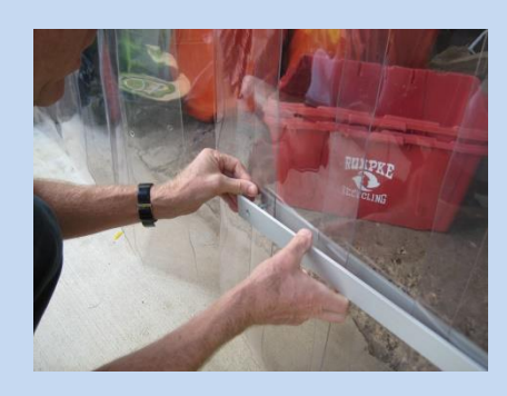
2. Locate and push the two outboard studs of the Weight thru the pair of pre-perforated holes in two outer slats of a 50" PARTAY Panel, both sides respectfully. Make sure that the slats stay in their front/back/front/back respective positions. Loosely secure wing nuts on both of the outer studs.