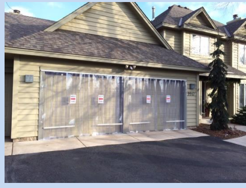
Outside with Garage Doors Closed

PARTAYGARAGE Wind Weight Kits improve the thermal efficiency of the PARTAYGARAGE System in blustery/windy conditions. Assemble the Kits as directed noting that <u>SAFETY WALK THRU SIGNS MUST BE USED!!</u> The Wind Weight Kits fall under the Hold Harmless Agreement of PARTAYGARAGE products.