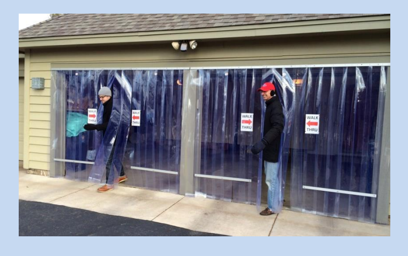
Gentlemen ~ Start Your PARTAY ENGINES!!