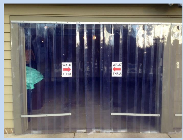
9, 10, and 18 foot wide doors utilize a narrow 26" wide panel. This small panel has minimal wind losses so weights for such are special order only. Wind Weights assemble as per above with the 26" panel in between. Now passage can be made with little motion of the wind weights.