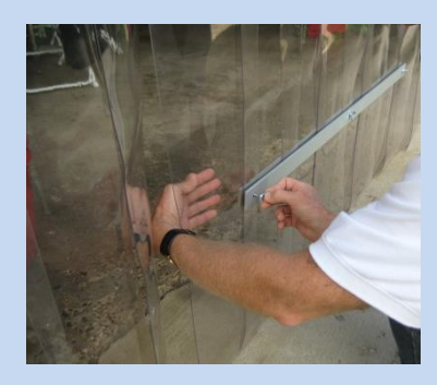
3. Arrange the slats in a balanced way so the overlaps are uniform and the panel drapes in a smooth fashion. Next secure the wing nuts snug in position to contain the panel as one unit.

4. Clip on the Walk Thru Signs, slightly below eye level, to the second slat from the outboard slat of the Weighted Panel. Have the arrow pointing in the direction where no weight is below it as shown.