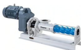
Flowrox PC pump E70