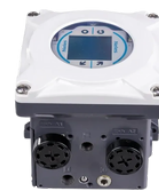
Neles NDX valve controller