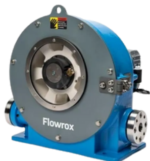
Flowrox LPP-D pump_2323