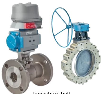
Jamesbury ball valves