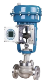
Neles globe valve