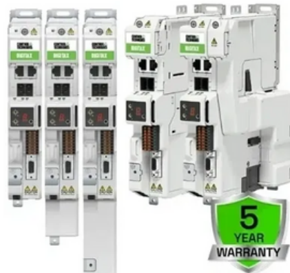
Servo Drives and Servo Motors