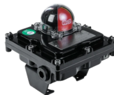
Neles Easyflow K-series limit switch