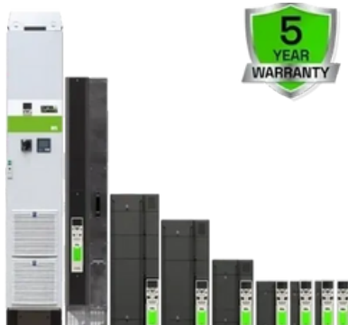
High Performance AC Drives