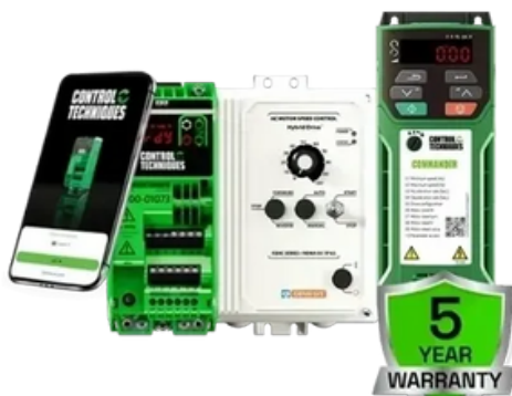
General Purpose AC Drives