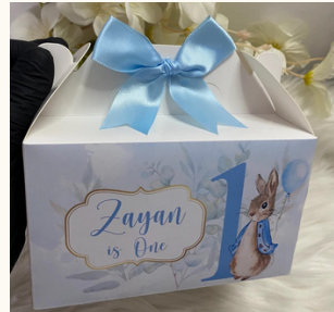
BASIC TREAT BOXES