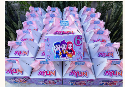
PREMIUM TREAT BOXES