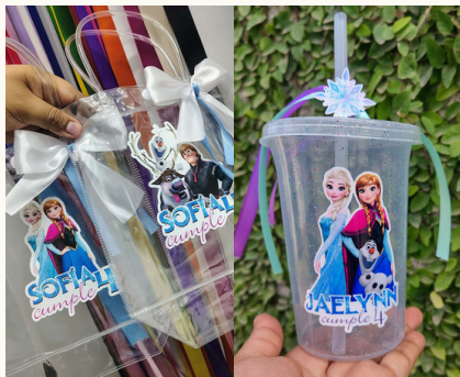
CLEAR GOODIE BAGS & CUP COMBO