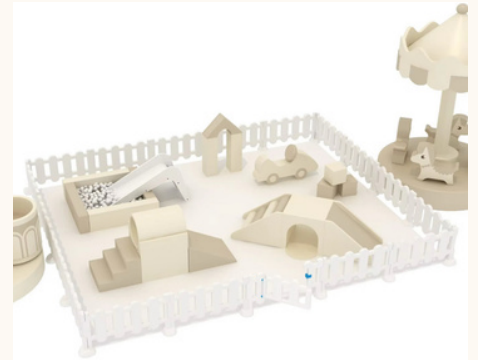
SOFT PLAY SET