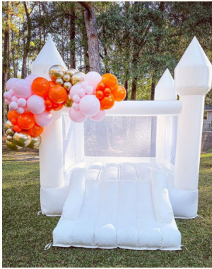
WHITE BOUNCE HOUSE (balloons would be an extra cost)