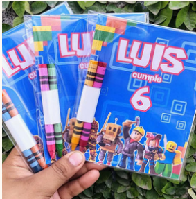
BASIC COLORING BOOKS