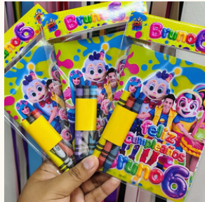
PREMIUM COLORING BOOKS