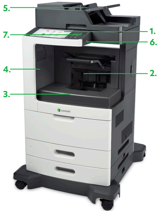
XM7263 model configured with Staple, Hole Punch Finisher