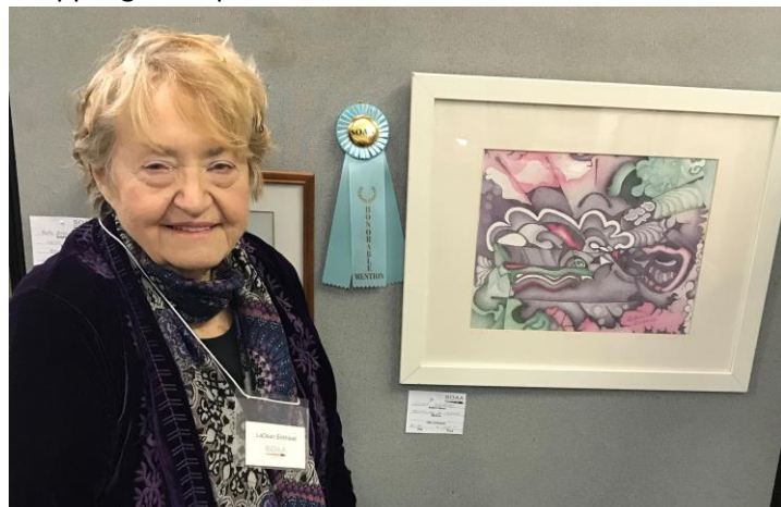
HONORABLE MENTION – LADEAN BIRKHEAD “Stippling on Paper”