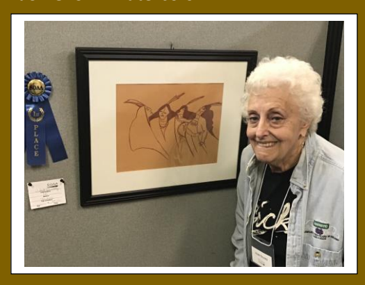
SECOND PLACE – MIKE BYRNE "LOVING SPOONFUL" – watercolor

FIRST PLACE – VIOLET SHOOLTZ "JUDGES" – watercolor