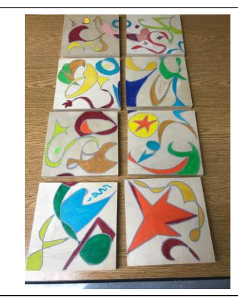
Delores Kotlarz – 2<sup>nd</sup> place "Untitled"