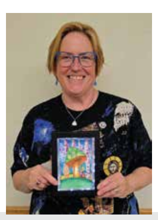
2nd Place, Joyce Knight Coyne Title: Mushrooms w/ Fairies Nightlight