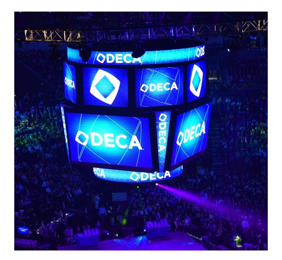
Please see agenda provided - this will be updated for students upon their arrival to Virginia Beach.