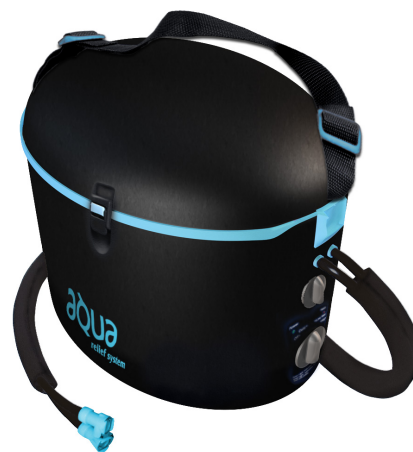
Aqua Relief System

Cold or Hot water is circulated all around the joint providing optimal 360 treatments. Hot water therapy system can provide cool or hot water for 6-8 hours. Provides added compression to further reduce pain and inflammation. Aqua-relief hot cold therapy device reduces chances of skin damage by continuously circulating the fluid. Allows movement of the joint without losing the ice. The machine is re-usable. Can be set from 32 F to 110F All bladders are Latex-free