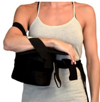
Doctor In the House Shoulder Immobilizer

Prescribing language: Shoulder Immobilizer