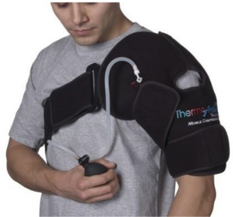
ThermoActive Shoulder Support Brace