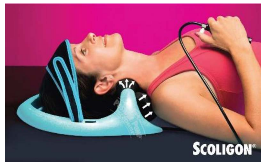
PosturePump Cervical Unit

Posture Pump cervical disc hydrator gently decompresses, shapes, and hydrates the discs in your neck. When the neck loses its natural curved shape, the soft discs that are in between the vertebrae become compressed, and rich lubricating fluid is unable to penetrate & hydrate the discs. This causes premature aging in the form of stiff, dry joints. The cervical traction unit counteracts that by lifting, stretching, decompressing, hydrating, & shaping the neck into its "vital" natural curved shape.