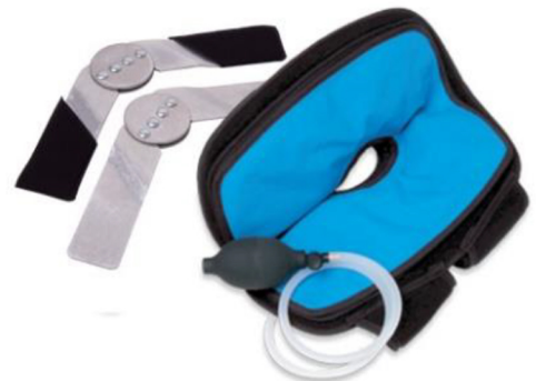
ThermoActive Elbow System

Prescribing language: Hinged Elbow Orthosis