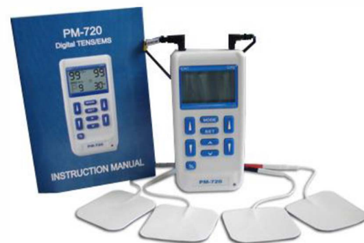
PM 720 Combination TENS EMS

Prescribing language: 4-Lead TENS/EMS unit with either Conductive Garment or 6 months of supplies