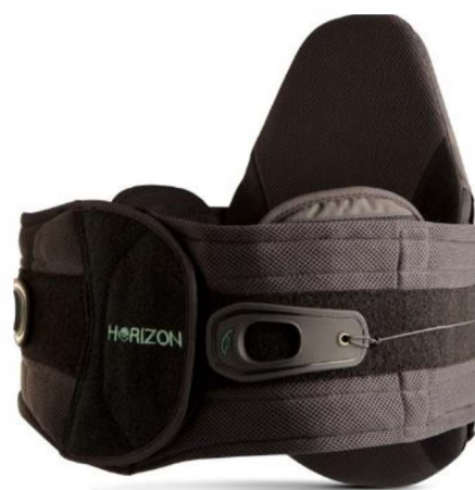
Aspen Horizon 637

One-size adjustable, all Horizon braces comfortably fit waists ranging from 24-70 inches