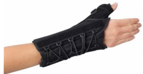
Procure Quick-Fit Wrist-Thumb Brace

Comfortable, lightweight nylon/foam laminate with adjustable dorsal pod to accommodate various size patients. Pre-contoured aluminum palmar and thumb stays may be adjusted for proper angulation to address wrist and thumb pathologies. Elastic straps with D-ring closure provide compressive support and maximum patient comfort. Universal size, available in right or left. Ideal for addressing deQuervain's Syndrome, Gamekeeper's thumb, scaphoid injuries, sprains and strains.