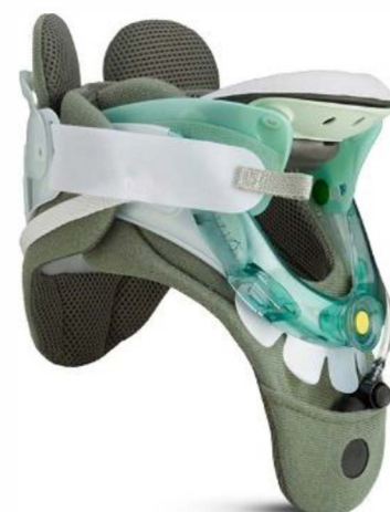
Aspen Vista® Multipost Therapy Collar

The Vista® MultiPost Therapy Collar is an active therapy device designed to reduce the symptoms of Forward Head Carriage. This unnatural head position can shift the cervical spine out of alignment, leading to radiculopathy, neuropathy and cervicogenic pain. The Vista® MultiPost Therapy Collar promotes improved posture and a more natural alignment which helps in the treatment of this disorder.