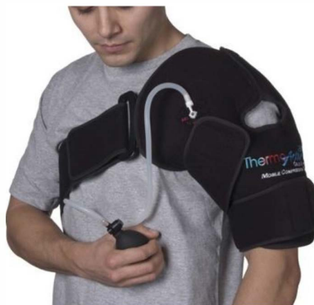
ThermoActive Shoulder Support Brace