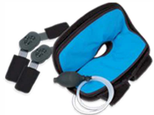
Thermoactive Knee System

Prescribing language: Thermoactive Hinged Knee Brace