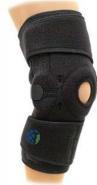
Hinged Knee Brace

Indicated for mild to moderate ligament joint pain, sprain, strains of the knee ligaments. Provides support, stabilization and compression of the knee joint following ligament or meniscus injuries.