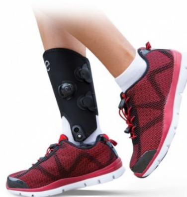
Exos Freemotion Hinged Ankle Brace CUSTOM*

Prescribing language: Custom Hinged Ankle Brace