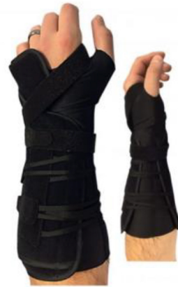
Trend Pro Wrist

An ideal product for patients suffering from many wrist and hand ailments, including carpal tunnel syndrome. Having the ability to set flexion/extension or put the wrist in a neutral position is a game changer in wrist bracing. Traditional wrist braces “cock-up” the wrist which creates pressure on the median nerve, potentially causing more pain for patients with carpal tunnel. The Trend Pro Wrist features universal sizing with an ambidextrous design, quick lace closure system, and a malleable frame to allow the brace to conform to any patient. An easy to use adjustable ROM hinge to allow for desired flexion and extension, and a nylon glove adds compression and warmth to the wrist/hand to promote blood flow