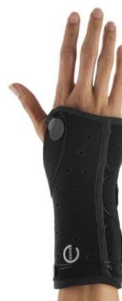
Exos Wrist Orthosis CUSTOM*

Intended for carpal bone injuries such as lunate, pisiform, or triquetral fractures, scapho-lunate dislocations, triangular fibro-cartilage complex (TFCC) tears, radio-carpal ligament injuries, or minimally displaced or stable distal radius or distal styloid fractures. May be used to support stable wrist fractures. May be used to control wrist motion for other injuries that require stabilization. Not made with natural rubber latex.