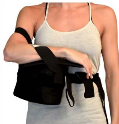
Doctor In the House Shoulder Immobilizer

Prescribing language: Shoulder Immobilizer