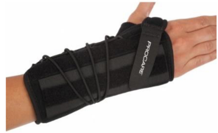
Procure Quick-Fit Wrist Brace