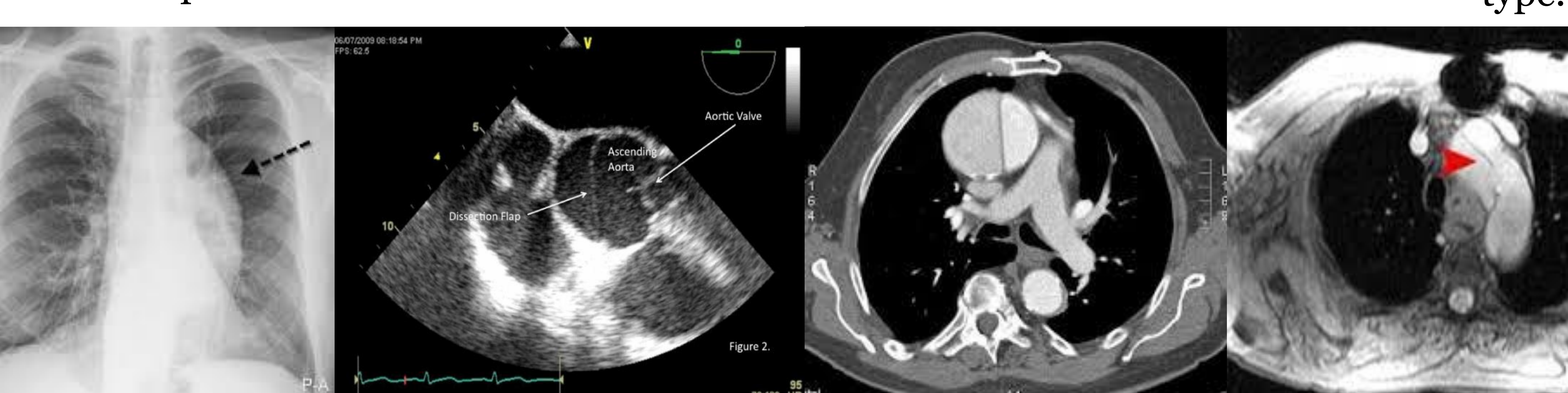
Figure 4: Echocardiography with Aortic dissection

BA, M. A. (1990). Optimal Diagnostic Imaging of Figure 6: MRI with Aortic dissection Aortic Dissection. Texas Heart Institute Journal.