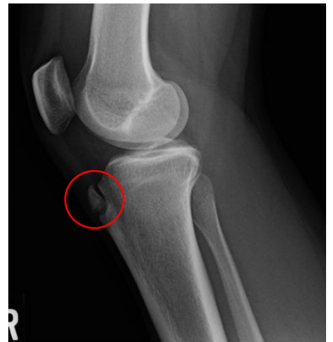
Figure 3 shows an ununited ossicle at the center of the tibial tubercle indicating Osgood Schlatter's Disease. 14

In 2020, 13 years later, the patient revisited the reoccurring pain with her current physician. The physician ordered diagnostic x-rays, and it was found that the patient has an ununited ossicle on the tibial tubercle, confirming Osgood Schlatter's Disease. The patient was then referred to an orthopedic physician. She met with the physician and discussed the symptoms along with the timeline of the condition. The doctor had the patient perform a series of tests including; walking, flexing and extending the knee, as well as stretching the muscles surrounding the knee. The patient was asked to rate the level of pain after each exercise. The patient was diagnosed with not only Osgood Schlatter's Disease, but also patellar tendinitis and patellofemoral pain syndrome. She was prescribed physical therapy