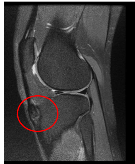
Figure 4 Sagittal MRI image showing edema at the ossicle and the synchondrosis. 15

After meeting with the surgeon and discussing what the next step in treatment should be, it was decided that the ossicle is to be excised. Treatment using