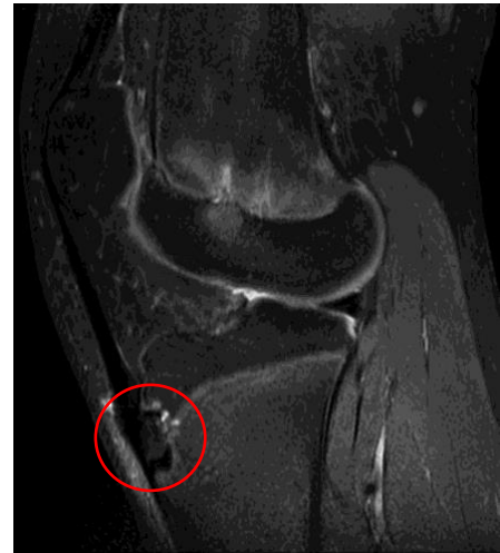
Figure 1 Sagittal MRI of right knee. Demonstrates the terminal stage of Osgood Schlatter's Disease. 7

Magnetic resonance imaging is able to identify five different stages of Osgood Schlatter's Disease compared to ultrasound: normal, early, progressive, terminal, and healing. 7 The normal stage of this condition shows no changes on the MRI scan, but the patient is symptomatic. The early stage may show signs of inflammation in the area of the secondary ossification center. Next, the progressive stage, reveals partial cartilage avulsion at the level of the secondary ossification center. The terminal stage then shows separated ossicles at the level of the tibial tubercle. Finally, the healing stage, described as osseous healing, demonstrates separated ossicles at the tibial tuberosity. 7 MRI is preferred due to its higher sensitivity than ultrasound, and it can determine soft tissue swelling at the tibial tubercle, edema of the patellar tendon, bone marrow edema, and deep infrapatellar bursitis. 5