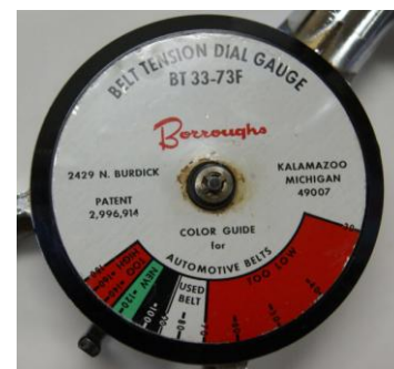
Figure 2 Belt Tension Gage Dial