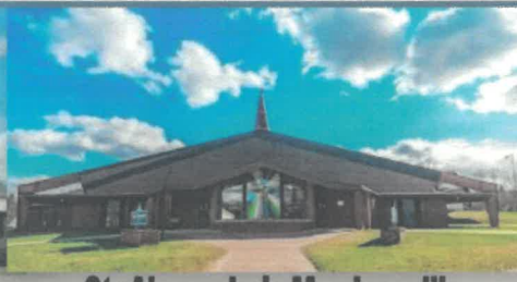
St. Alexander's Morrisonville 1 Church Street-Morrisonville, NY 12962