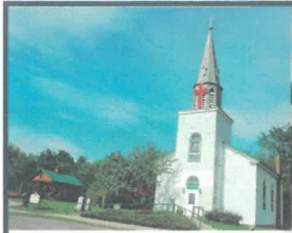
St. Patrick's Peru & Mother Cabrini Shrine

Catholic Faith Communities United in the Love of Jesus