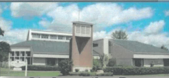
St. Augustine Peru 3035 Main St., Peru, NY 12972