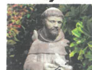
Care of Creation reimagined by the Sisters of St. Joseph of Orange