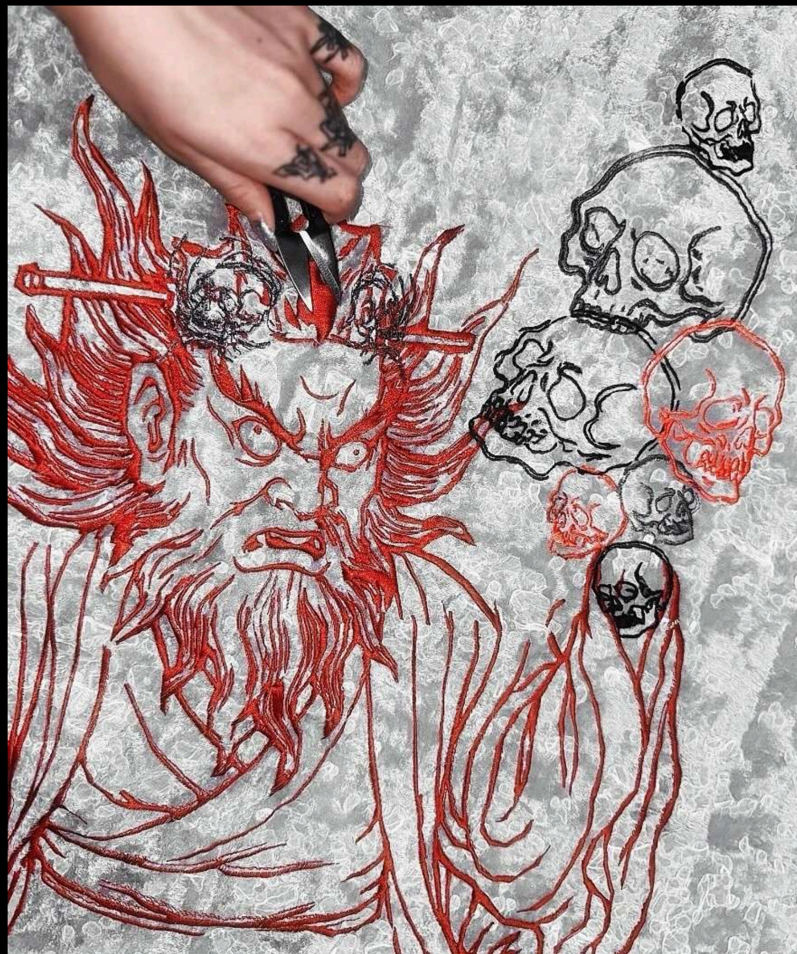
Embroidery - 刺繡 2025.09 「Stay Alive!!!」 original.閻魔