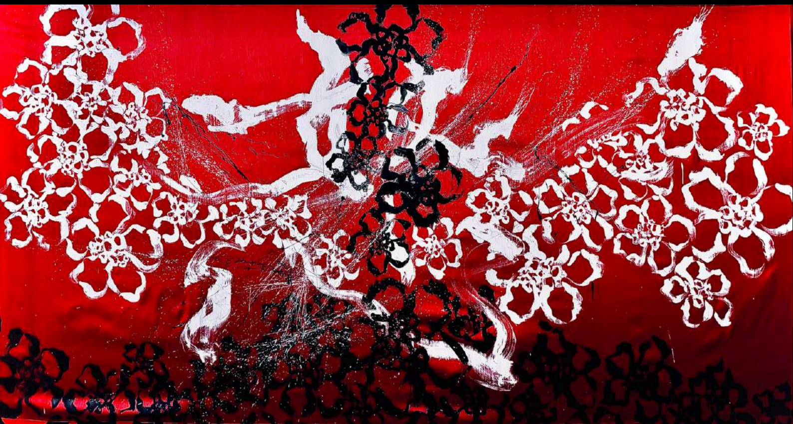
2024.02 「怒 - SHIBUYA CRANK St. -」