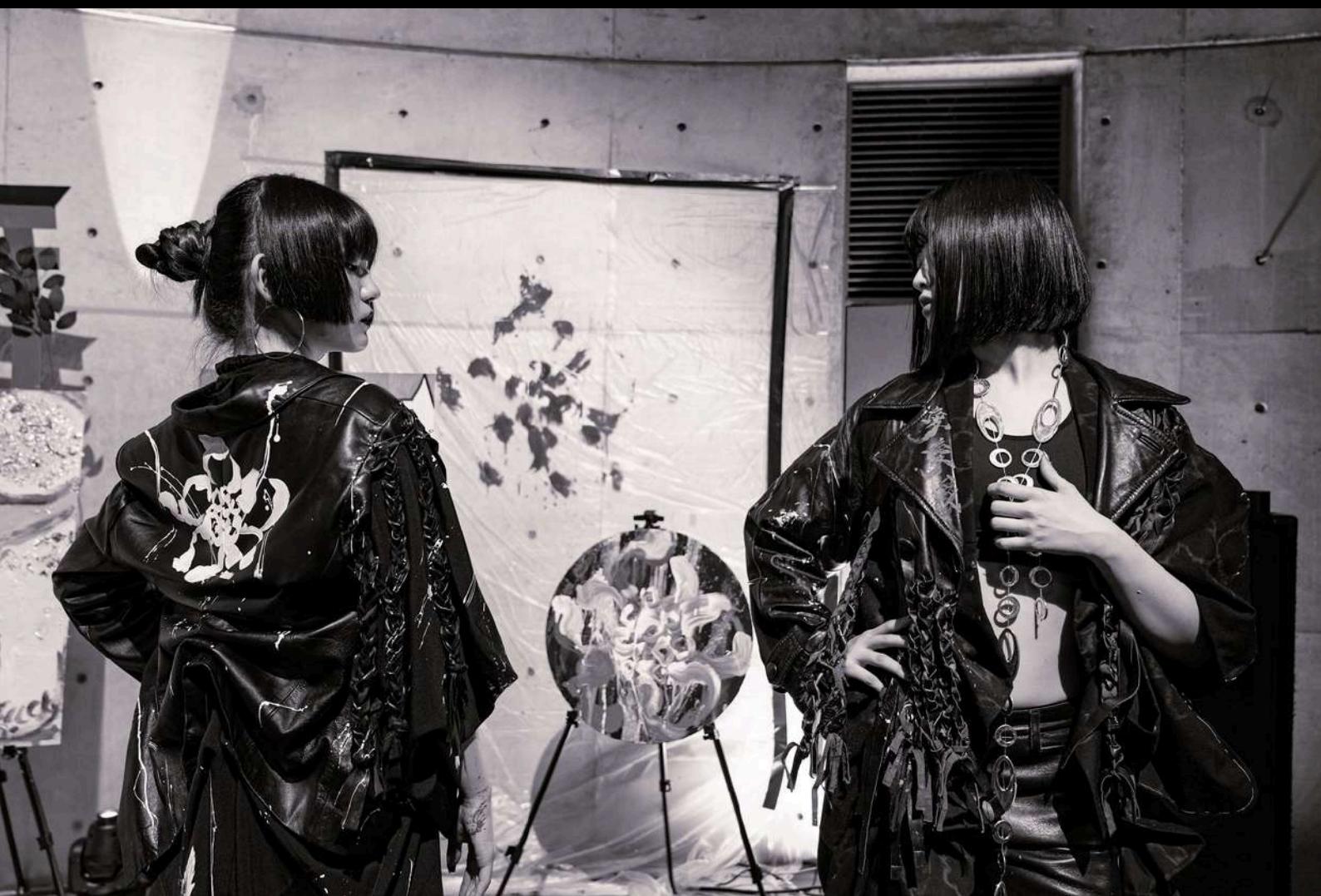
Live paint 2023.05