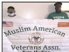
MAVA POSTS PARTICIPATE IN JUNETEENTH 2022 See Page 8