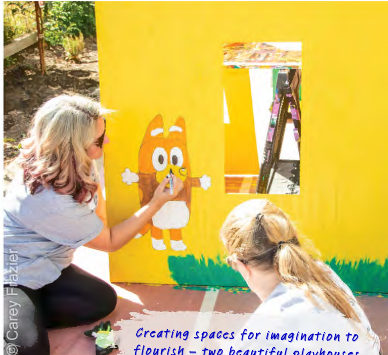
Creating spaces for imagination to flourish – two beautiful playhouses built with care.