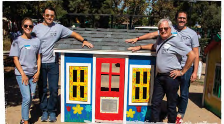
Turning over a new leaf: Volunteers breathe life into this Long Beach garden.

"They have many youth under five, so the playhouse was a welcomed addition to their play area."