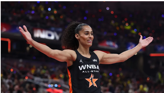
Jul 19, 2025; Indianapolis, IN, USA; Team Collier guard Skylar Diggins [4] reacts in the first half against Team Clark in the 2025 WNBA All Star Game at Gainbridge Fieldhouse.