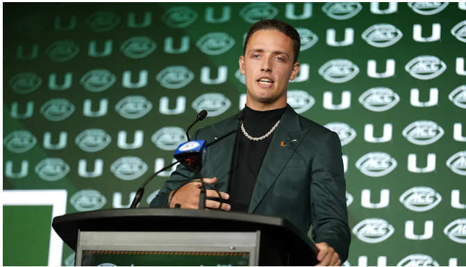
Jul 22, 2025; Charlotte, NC, USA; Miami quarterback Carson Beck answers questions from the media during ACC Media Days at Hilton Charlotte Uptown.

The ACC became the final Power Four conference to release its media poll as last week's media days ended. Where do Notre Dame's six opponents rank and how tough are they, at least in the eyes of the media?