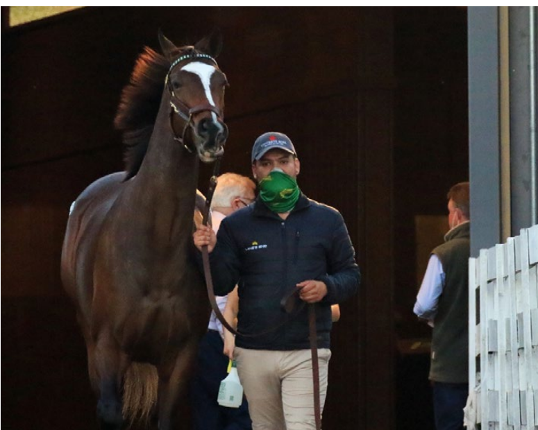
Concrete Rose sells for $1.95 million to OXO Equine to top the Keeneland November Sale

internet bidding into the live sale process and to expand its telephone bidding option.