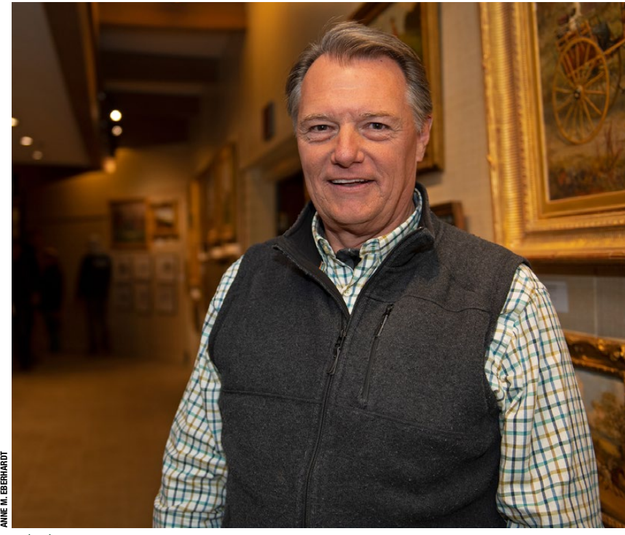
There were a fair number of breeders who held their good weanlings back because they didn't want to sell in this COVID market. It holds out hope for the yearling market next year."

"Buying weanlings was extremely difficult because there wasn't the supply of quality weanlings. I've heard mixed things—that people were holding their better weanlings to sell as yearlings when the COVID market is over; I've heard that some people didn't enter because Aug. 1 was the deadline; they got hammered in September and now have reentered for January."