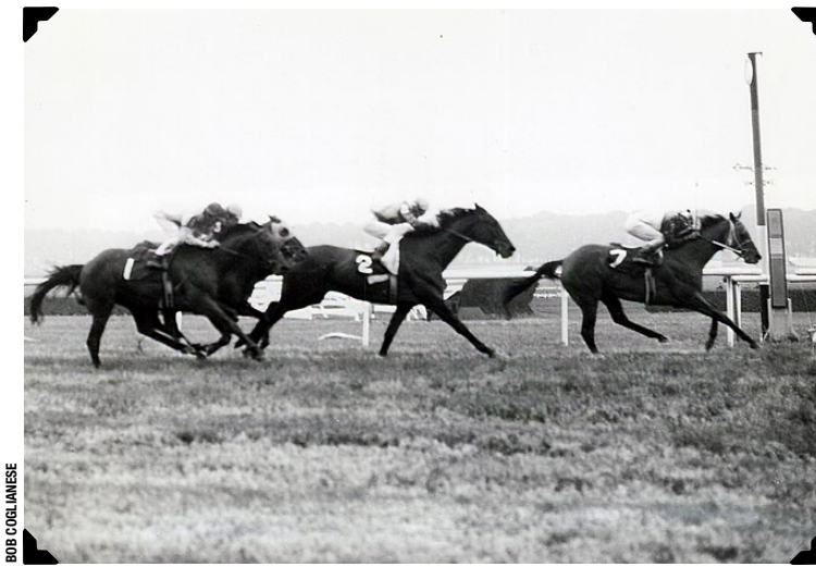
Drumtop takes the 1970 Edgemere Handicap at Belmont Park

Drumtop ended her season with a victory in the 13-furlong Canadian International Championship Stakes at Woodbine. BH