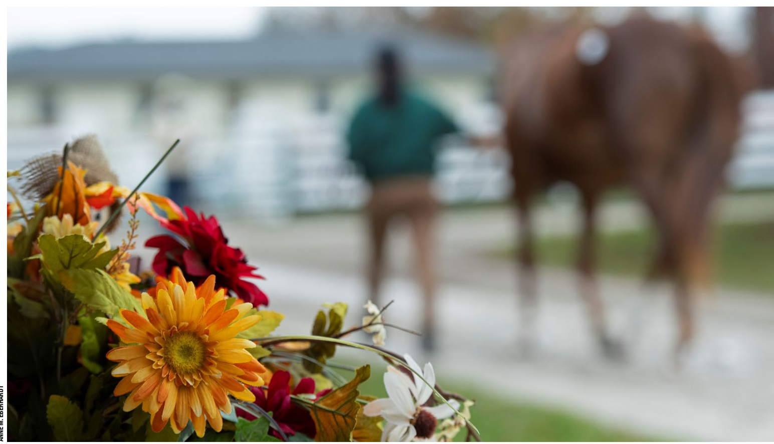
A horse walks on the grounds at the Keeneland November Sale