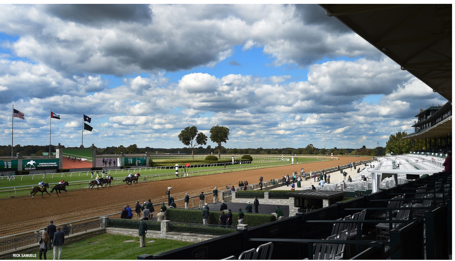
Racing without fans during the Keeneland fall meet

All Kentuckians are welcome at these sites and are urged to take advantage of the additional COVID testing available to them. There are more than 350 testing sites across the state. BH