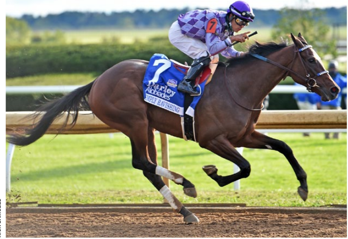
Simply Ravishing wins the Alcibiades Stakes at Keeneland

going to get a rest through the first of the year, and we'll put her in training."