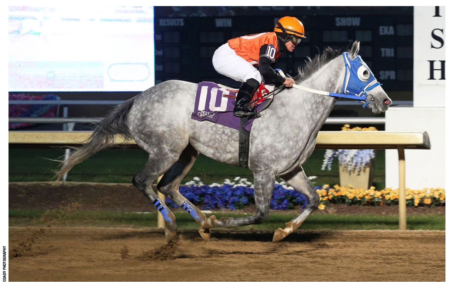
Piedi Bianchi wins the Frances Slocum Stakes by 7 1/2 lengths at Indiana Grand

Margins: 2, 2¼, ½. Others: Flatter Hymn ($5,640), Classy Cowboy ($2,820), Jova ($1,000), Wholelotachocolate ($1,000), Two Last Words ($1,000), Mystery Unbridled ($1,000), Toss of Fate ($1,000),