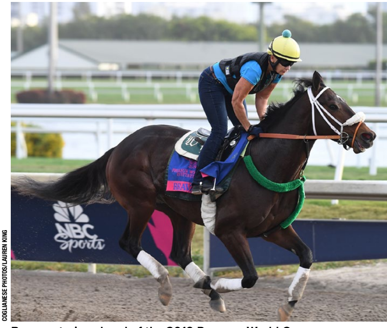
Bravazo trains ahead of the 2019 Pegasus World Cup Invitational Stakes at Gulfstream Park

on to place third in the Breeders' Cup Dirt Mile (G1) and second in the Clark Handicap Presented by Norton Healthcare (G1).