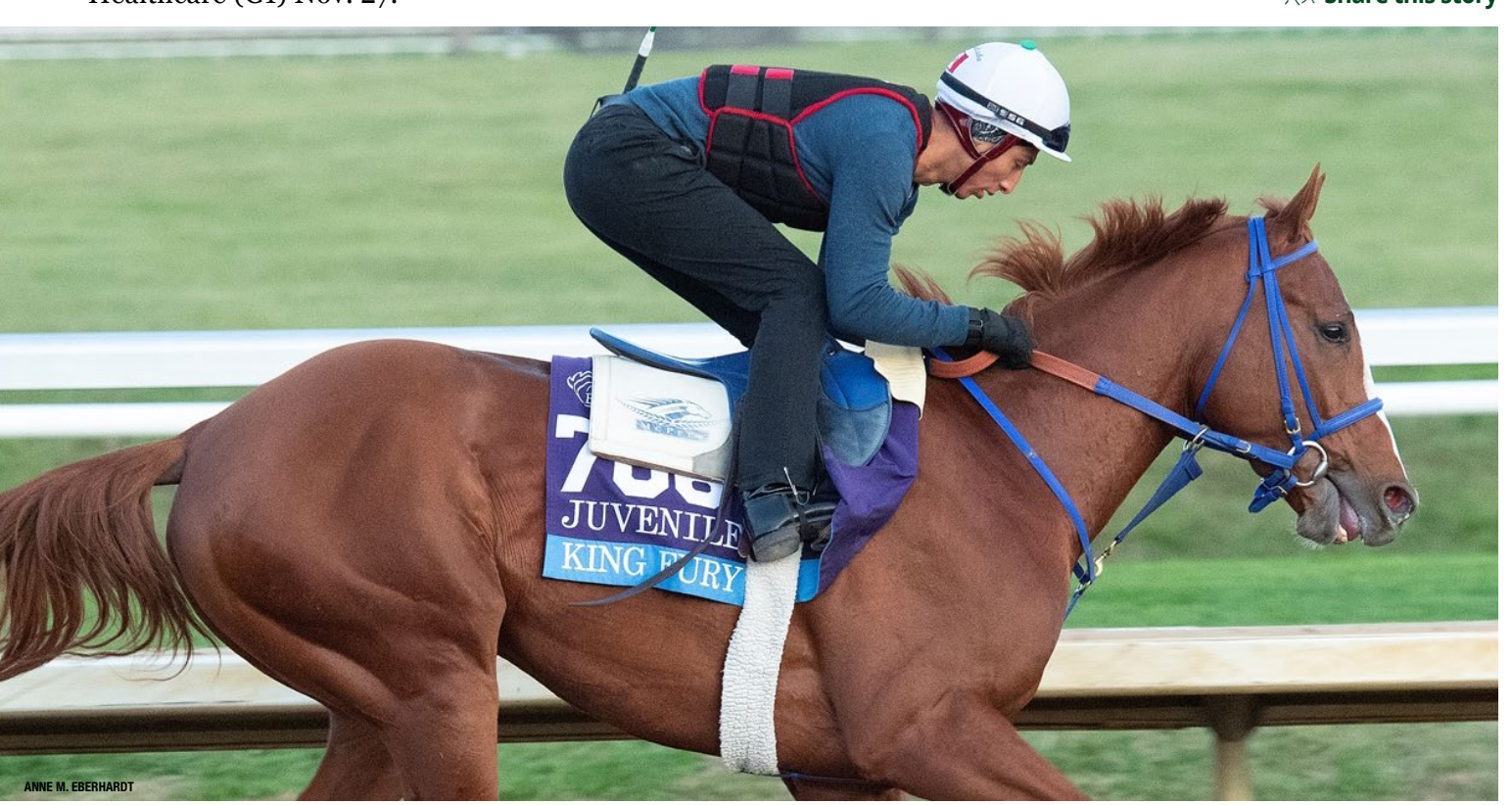
King Fury trains ahead of the Breeders' Cup Juvenile at Keeneland

Shared Sense is a colt he plans to send to New York for the Nov. 28 Discovery Stakes (G3), and Arklow, Juliet Foxtrot, and Royal Prince are headed west for races at Del Mar—pointed toward next week's Hollywood Turf Cup (G2T), Matriarch (G1T), and Cecil B. DeMille (G3T) stakes, respectively.