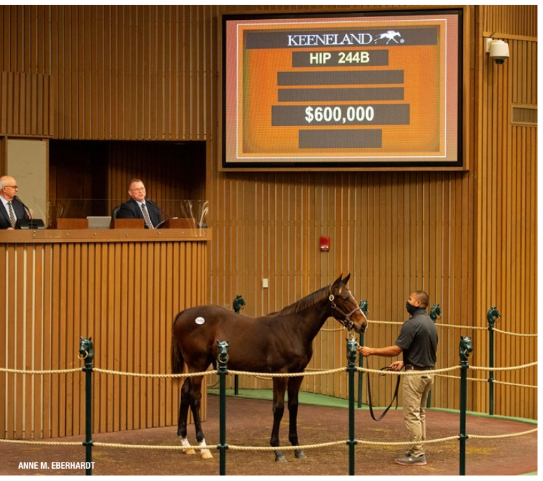
The American Pharoah colt consigned as Hip 244B was the co-highest-priced weanling of the Keeneland November Sale

s the curtain closed on its 10-day November Breeding Stock Sale, Keeneland officials were expressing gratitude for the resiliency within the industry that allowed the racing and sales company not only to hold its events as scheduled despite COVID-19, but also with results that belied the circumstances.