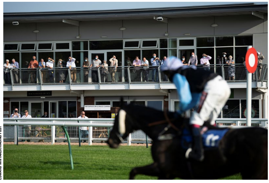
A horse races past the stands at Warwick

British fixtures continue to be attended only by the sport's professionals and a limited number of owners, with annual members having made only brief returns on single days at Doncaster and Warwick in September. In a further setback, one day after the Warwick trial event the Department for Digital, Culture, Media, and Sport informed sports governing bodies the return of fans could be delayed until March at the earliest.