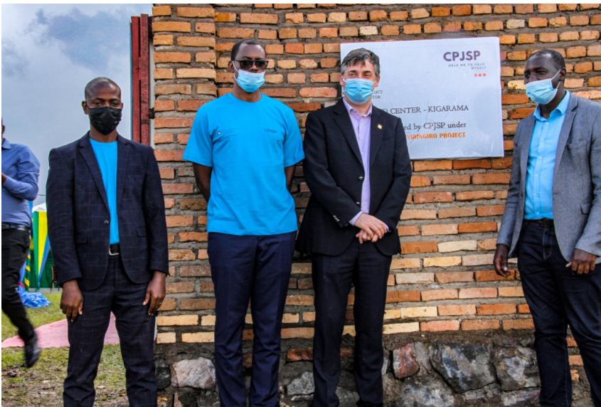
From the left to the right: Executive director of CPJSP, COP of EDC, GRATE LAKES REGION DIRECTOR OF SWISS COOPERATION, KAMONYI DISTRICT MAYOR.

CPJSP organized a launch of Tugribyiringiro projet and invite all the partners such as SWISSE EMBSSY, KAMONYI DISTRICT, EDUCATION DEVELOPMENT CENTER, and others