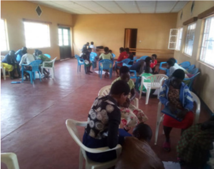
Work readiness at KIGESE

CPJSP provided a work readiness training to the 179 teen mothers and conducting work based learning in different work place for being more familiar with the workplace