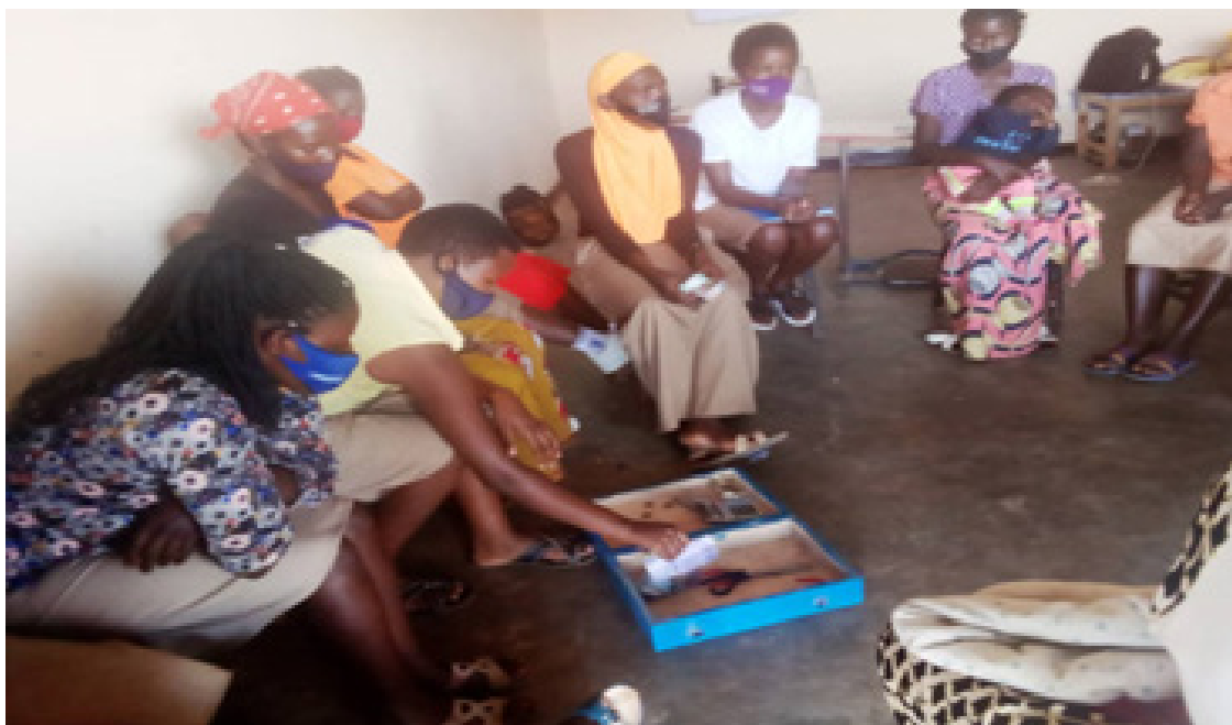
Work readiness training at KIGARAMA cell RUGARIKA Sector

Creating and accompanied 9 self-help groups in Kamonyi where youth can save and lend money easily for his own development