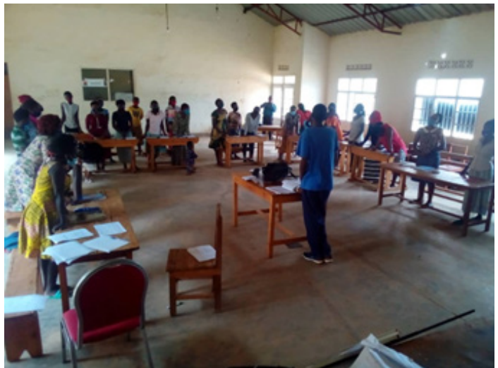
Work readiness at KIGESE