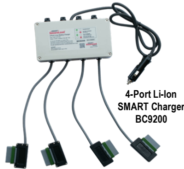
4-Port Li-Ion SMART Charger BC9200