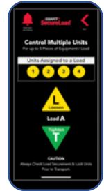
Mobile App (iOS/Android)