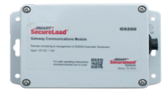
Gateway Communications Module B9200