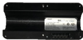
Rechargeable Battery Pack B9200