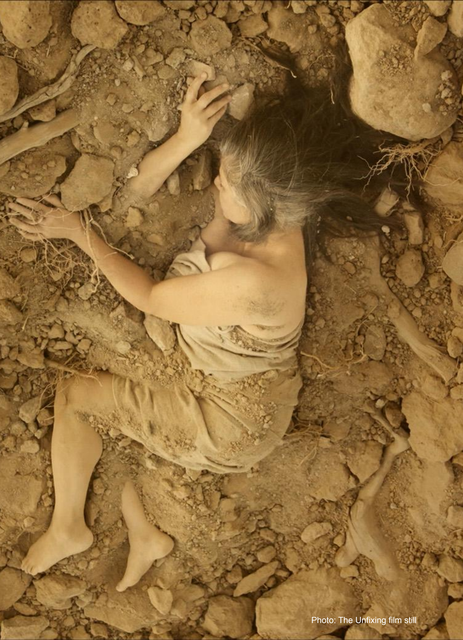
Photo: The Unfixing film still