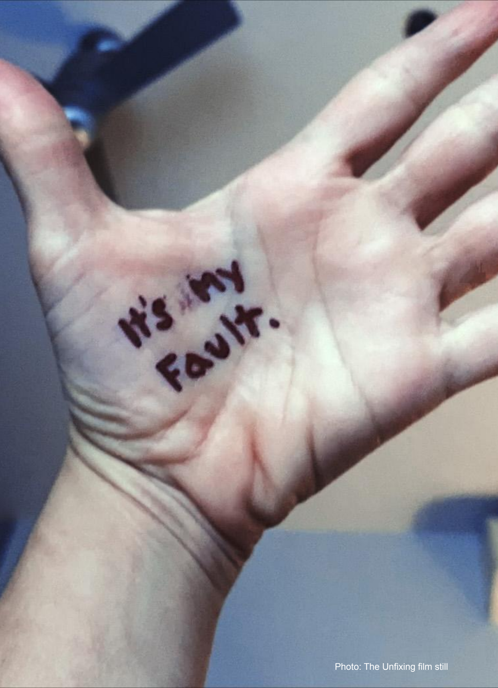
Photo: The Unfixing film still