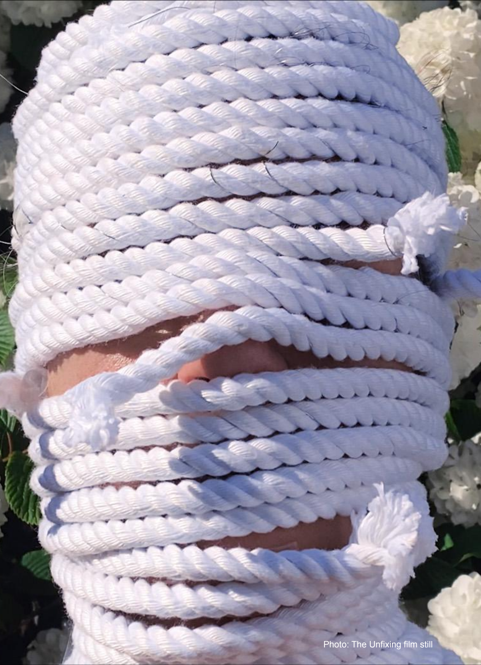
Photo: The Unfixing film still