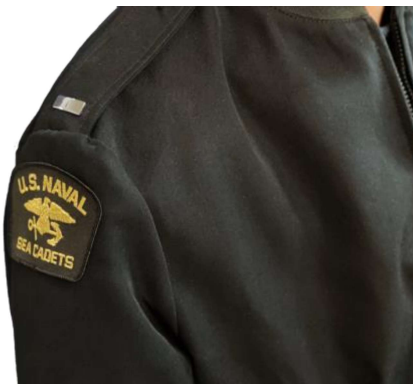
FIGURE 4-1-4 NSCC OFFICER METAL GRADE INSIGNIA