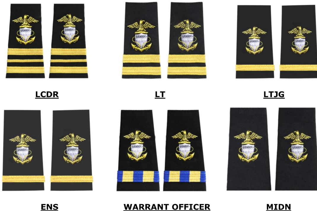
FIGURE 4-1-3 NSCC OFFICER SOFT SHOULDER BOARDS