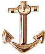
RIGHT LAPEL ANCHOR