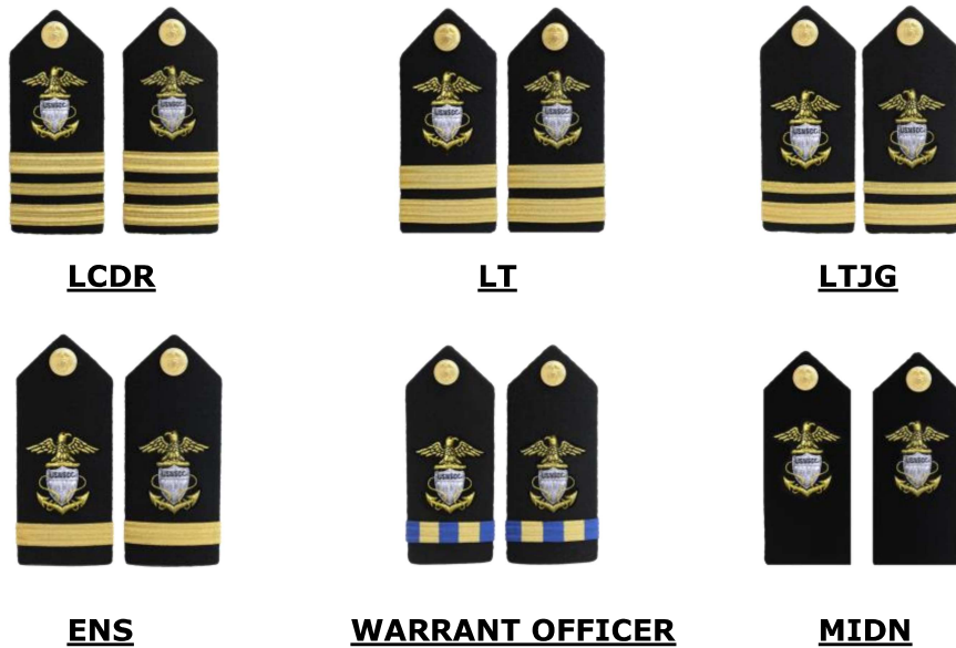
FIGURE 4-1-2 NSCC OFFICER HARD SHOULDER BOARDS