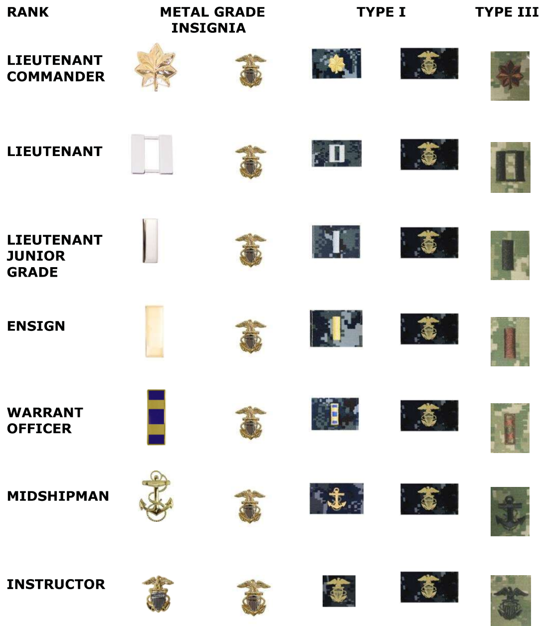
FIGURE 4-1-7 NSCC OFFICER, MIDN AND INST COLLAR GRADE INSIGNIA