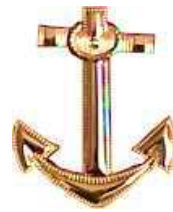
LEFT LAPEL ANCHOR