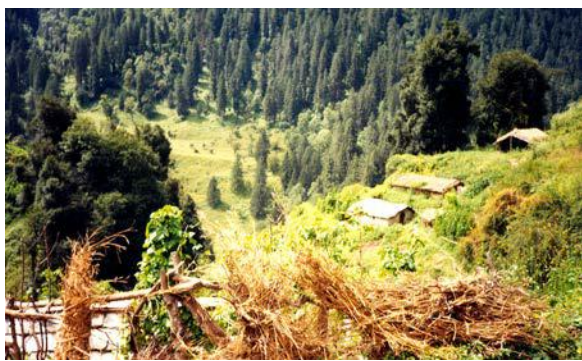
Figure 16.2 A view of a forest life

Do you think such use of forest resources would lead to the exhaustion of these resources? Do not forget that before the British came and took over most of our forest areas, people had been living in these forests for centuries. They had developed practices to ensure that the resources were used in a sustainable manner. After the British took control of the forests (which they exploited ruthlessly for their own purposes), these people were forced to depend on much smaller areas and forest resources started becoming over-exploited to some extent. The Forest Department in independent India took over from the British but local knowledge and local needs continued to be ignored in the management practices. Thus vast tracts of forests have been converted to monocultures of pine, teak or eucalyptus. In order to plant these trees, huge areas are first cleared of all vegetation. This destroys a large amount of biodiversity in the area. Not only this, the varied needs of the local people – leaves for fodder, herbs for medicines, fruits and nuts for food – can no longer be met from such forests. Such plantations are useful for the industries to access specific products and are an important source of revenue for the Forest Department.