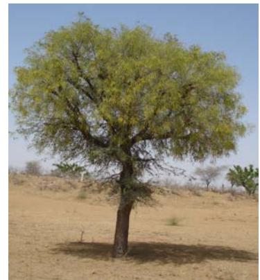
Figure 16.3 Khejri Tree

We need to accept that human intervention has been very much a part of the forest landscape. What has to be managed in the nature and what may be the extent of this intervention? Forest resources ought to be used in a manner that is both environmentally and developmentally sound – in other words, while the environment is preserved, the benefits of the controlled exploitation go to the local people, a process in which decentralised economic growth and ecological conservation go hand in hand. The kind of economic and social development we want will ultimately determine whether the environment will be conserved or further destroyed. The environment must not be regarded as a pristine collection of plants and animals. It is a vast and complex entity that offers a range of natural resources for our use. We need to use these resources with due caution for our economic and social growth, and to meet our material aspirations.