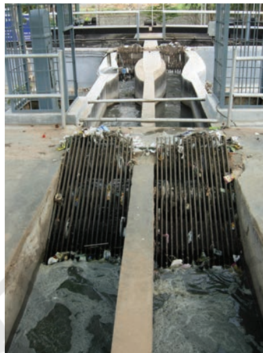
Fig. 18.3 Bar screen