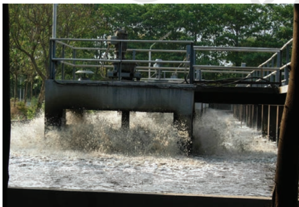
Fig. 18.6 Aerator

After several hours, the suspended microbes settle at the bottom of the tank as activated sludge. The water is then removed from the top.