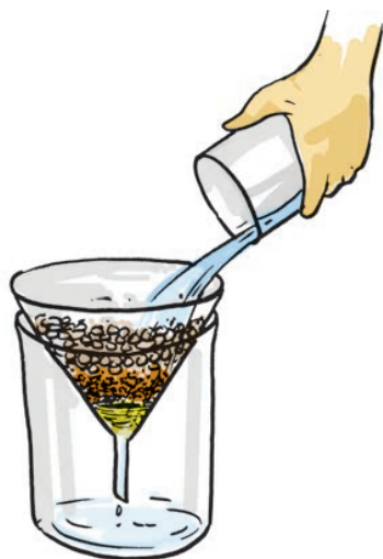
Fig. 18.2 Filtration process