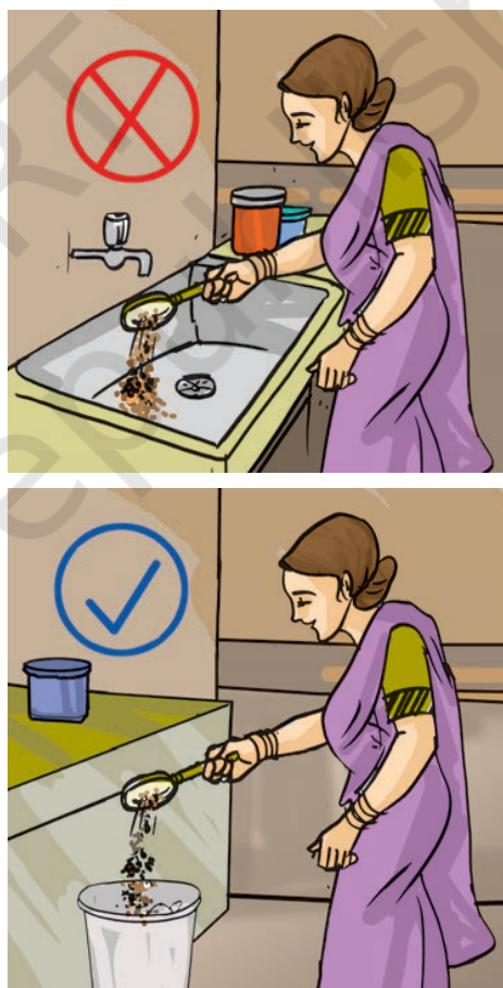
Fig. 18.7 Do not throw everything in the sink