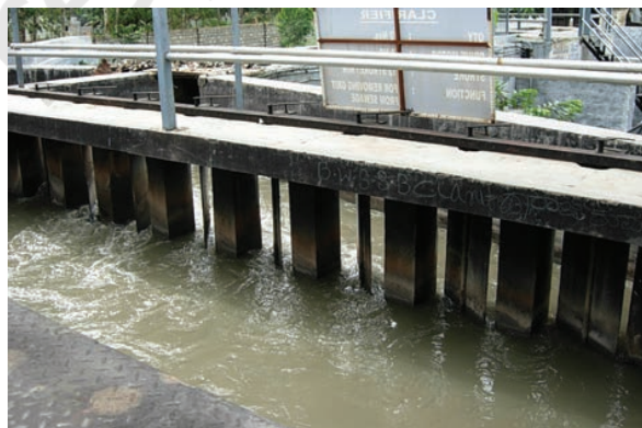
Fig. 18.4 Grit and sand removal tank