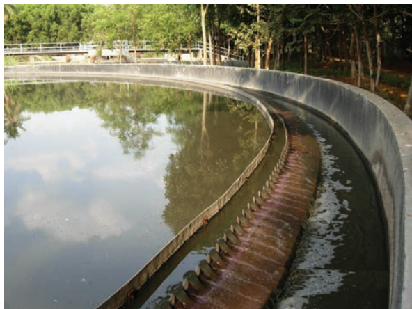
Fig. 18.5 Water clarifier

a scraper. This is the sludge . A skimmer removes the floatable solids like oil and grease. Water so cleared is called clarified water (Fig. 18.5).