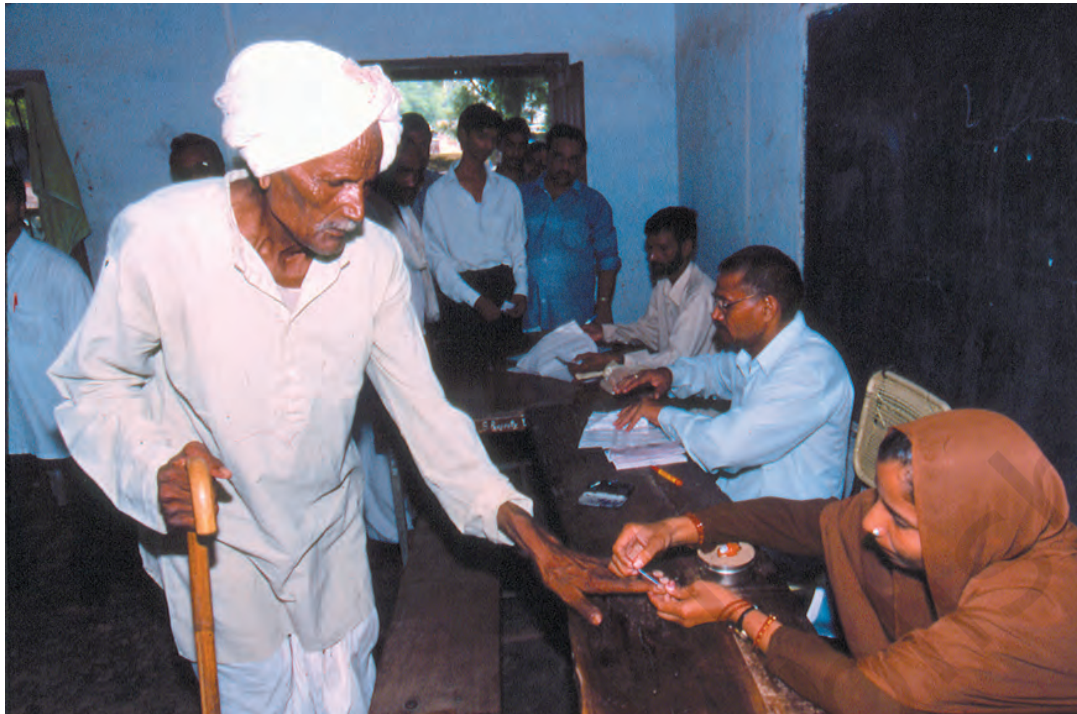
Voting in a rural area: A mark is put on the finger to make sure that a person casts only one vote.

decisions for the entire population. These days a government cannot call itself democratic unless it allows what is known as universal adult franchise. This means that all adults in the country are allowed to vote.