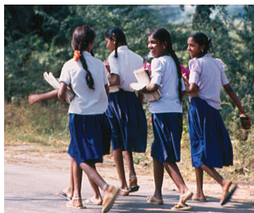
Why do girls like to go to school together in groups?

In what ways do the experiences of Samoan children and teenagers differ from your own experiences of growing up? Is there anything in this experience that you wish was part of your growing up?