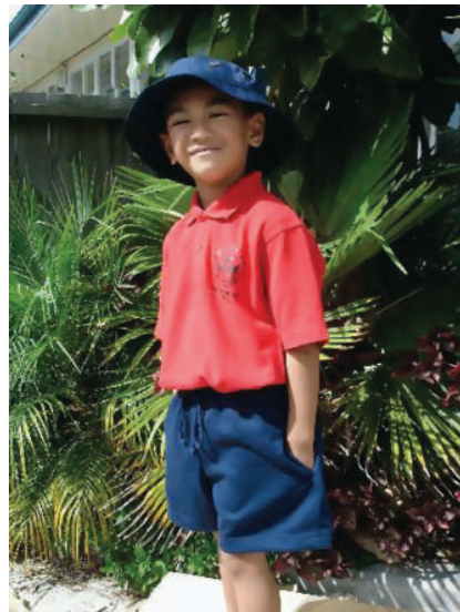
A Class VII Samoan child in his school uniform.

From Class VI onwards, boys and girls went to separate schools. The girls' school was designed very differently from the boys' school. They had a central courtyard where they played in total seclusion and