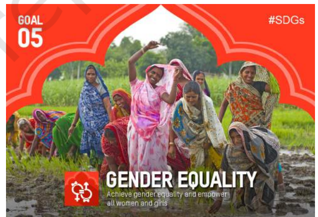
Sustainable Development Goal (SDG) www.in.undp.org