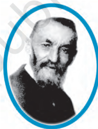
G. Peano (1858-1932)

In contrast to deduction, inductive reasoning depends on working with each case, and developing a conjecture by observing incidences till we have observed each and every case. It is frequently used in mathematics and is a key aspect of scientific reasoning, where collecting and analysing data is the norm. Thus, in simple language, we can say the word induction means the generalisation from particular cases or facts.