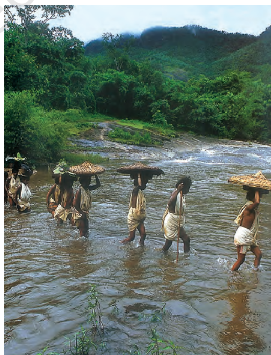
Fig. 1 – Women of the Dongria Kandha tribe in Orissa waded through the river on the way to the market

You have read about tribal societies last year. Most tribes had customs and rituals that were very different from those laid down by Brahmans. These societies also did not have the sharp social divisions that were characteristic of caste societies. All those who belonged to the same tribe thought of themselves as sharing common ties of kinship. However, this did not mean that there were no social and economic differences within tribes.