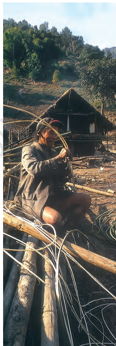
Fig. 5 – A log house being built in a village of the Nishi tribes of Arunachal Pradesh.

Bewar – A term used in Madhya Pradesh for shifting cultivation