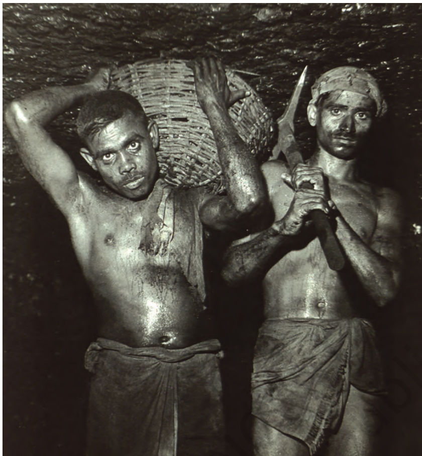
Fig. 10 – Coal miners of Bihar, 1948

In the 1920s about 50 per cent of the miners in the Jharia and Raniganj coal mines of Bihar were tribals. Work deep down in the dark and suffocating mines was not only back-breaking and dangerous, it was often literally killing. In the 1920s over 2,000 workers died every year in the coal mines in India.