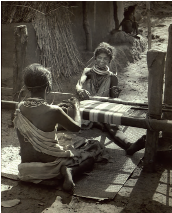
Fig. 8 – Godara women weaving

Many tribal groups reacted against the colonial forest laws. They disobeyed the new rules, continued with practices that were declared illegal, and at times rose in open rebellion. Such was the revolt of Songram Sangma in 1906 in Assam, and the forest satyagraha of the 1930s in the Central Provinces.