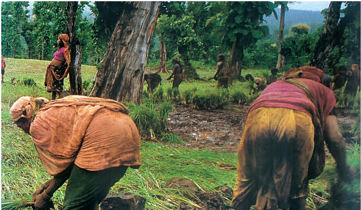
Fig. 6 – Bhil women cultivating in a forest in Gujarat

Shifting cultivation continues in many forest areas of Gujarat. You can see that trees have been cut and land cleared to create patches for cultivation.