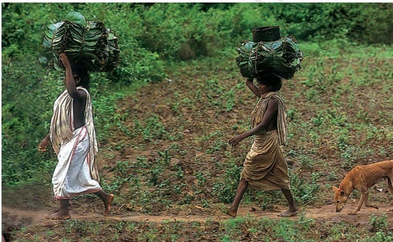
Fig. 2 – Dongria Kandha women in Orissa take home pandanus leaves from the forest to make plates

Mahua – A flower that is eaten or used to make alcohol