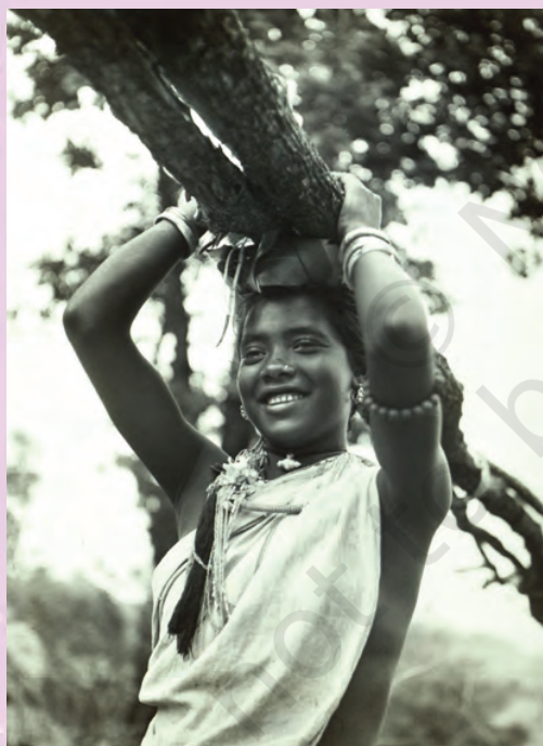
Fig. 4 – A Santhal girl carrying firewood, Bihar, 1946

Adapted from Verrier Elwin, Baiga (1939) and Elwin's unpublished 'Notes on the Khonds' (Verrier Elwin Papers, Nehru Memorial Museum and Library)