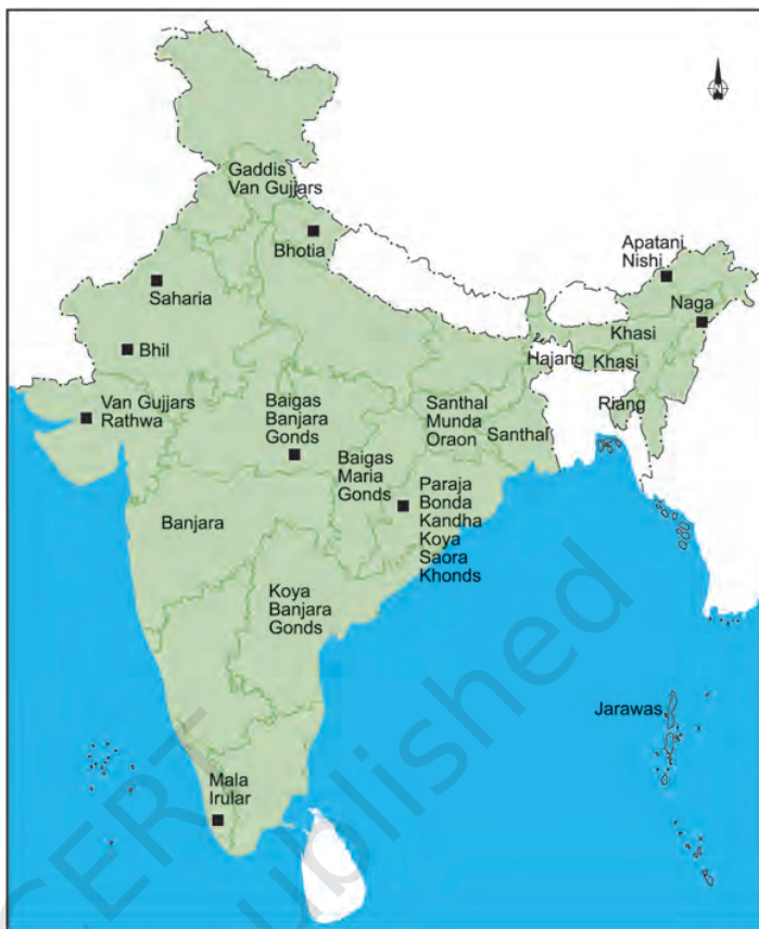
Fig. 3 – Location of some tribal groups in India

Many tribal groups lived by herding and rearing animals. They were pastoralists who moved with their herds of cattle or sheep according to the seasons. When the grass in one place was exhausted, they moved to another area. The Van Gujjars of the Punjab hills and the Labadis of Andhra Pradesh were cattle herders, the Gaddis of Kulu were shepherds, and the Bakarwals of Kashmir reared goats. You will read more about them in your history book next year.