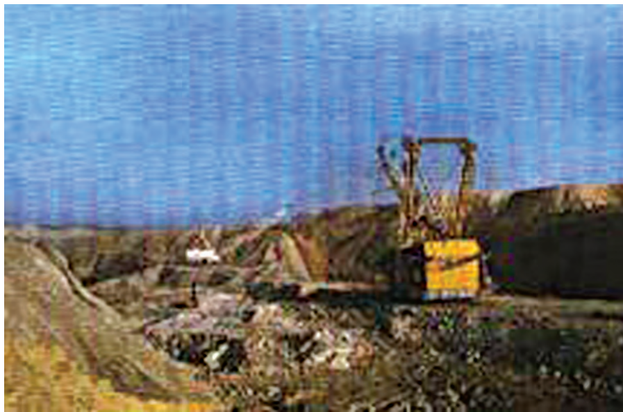
Fig. 5.2: A coal mine

When heated in air, coal burns and produces mainly carbon dioxide gas.