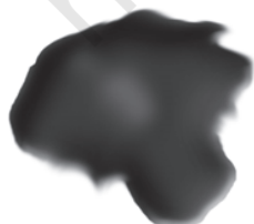
Fig. 5.3: Coal tar

It is a black, thick liquid (Fig. 5.3) with an unpleasant smell. It is a mixture of