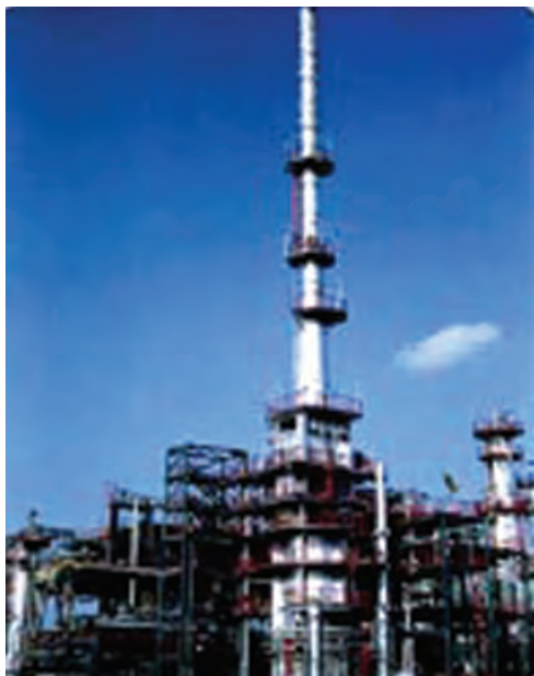
Fig. 5.5: A petroleum refinery

separating the various constituents/ fractions of petroleum is known as refining. It is carried out in a petroleum refinery (Fig. 5.5).