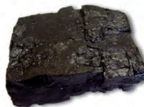
Fig. 5.1: Coal

You may have seen coal or heard about it (Fig. 5.1). It is as hard as stone and is black in colour.