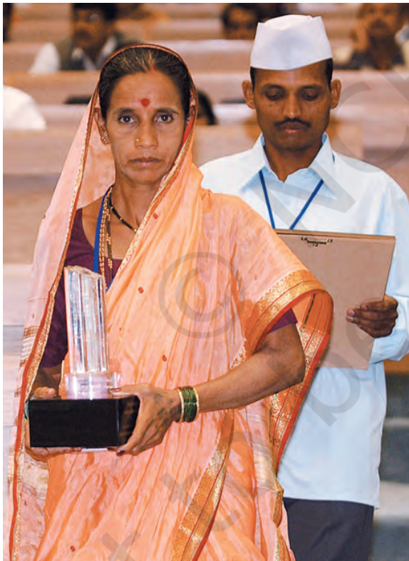
Two village Panchs from Maharashtra who were awarded the Nirmal Gram Puruskar in 2005 for the excellent work done by them in the Panchayat.

In some states, Gram Sabhas form committees like construction and development committees. These committees include some members of the Gram Sabha and some from the Gram Panchayat who work together to carry out specific tasks.