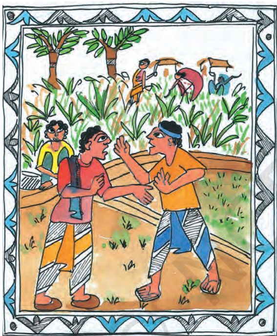
A Quarrel in the Village

There are more than six lakh villages in India. Taking care of their needs for water, electricity, road connections, is not a small task. In addition to this, land records have to be maintained and conflicts too need to be dealt with. A large machinery is in place to deal with all this. In this chapter we will look at the work of two rural administrative officers in some detail.