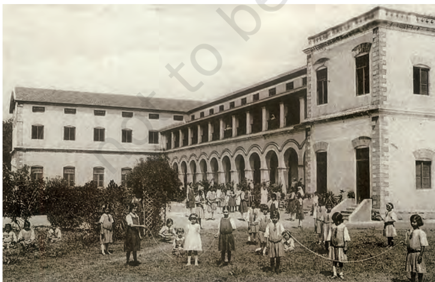
Fig. 12 – Children playing in a missionary school in Coimbatore, early twentieth century

Many individuals and thinkers were thus thinking about the way a national educational system could be fashioned. Some wanted changes within the system set up by the British, and felt that the system could be extended so as to include wider sections of people. Others urged that alternative systems be created so that people were educated into a culture that was truly national. Who was to define what was truly national? The debate about what this “national education” ought to be continued till after independence.