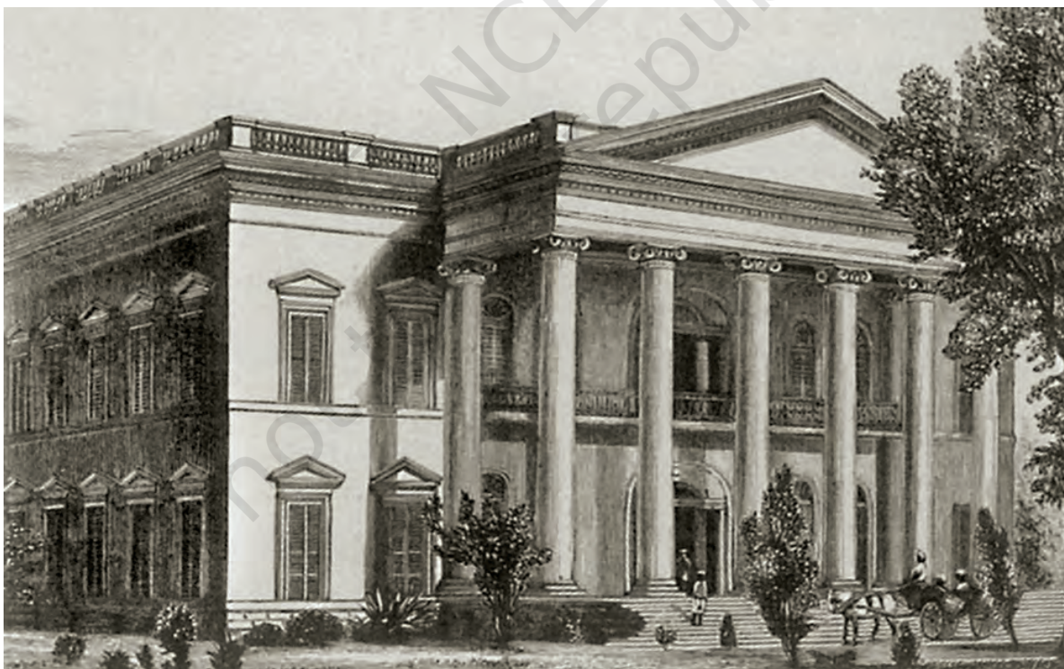
Fig. 7 – Serampore College on the banks of the river Hooghly near Calcutta

Over the nineteenth century, missionary schools were set up all over India. After 1857, however, the British government in India was reluctant to directly support missionary education. There was a feeling that any strong attack on local customs, practices, beliefs and religious ideas might enrage “native” opinion.