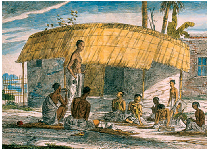
Fig. 8 – A village pathshala

Adam discovered that this flexible system was suited to local needs. For instance, classes were not held during harvest time when rural children often worked in the fields. The pathshala started once again when the crops had been cut and stored. This meant that even children of peasant families could study.