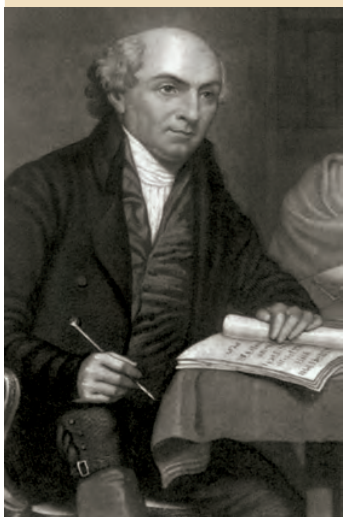
Fig. 6 – William Carey was a Scottish missionary who helped establish the Serampore Mission

The argument for practical education was strongly criticised by the Christian missionaries in India in the nineteenth century. The missionaries felt that education should attempt to improve the moral character of the people, and morality could be improved only through Christian education.