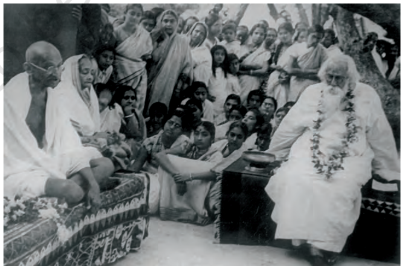
Fig. 10 – Mahatma Gandhi along with Kasturba Gandhi sitting with Rabindranath Tagore and a group of girls at Santiniketan, 1940

Western education, Mahatma Gandhi said, focused on reading and writing rather than oral knowledge; it valued textbooks rather than lived experience and practical knowledge. He argued that education ought to develop a person’s mind and soul. Literacy – or simply learning to read and write – by itself did not count as education. People had to work with their hands, learn a craft, and know how different things operated. This would develop their mind and their capacity to understand.