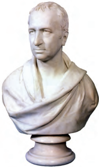
Fig. 2 – Henry Thomas Colebrooke

He was a scholar of Sanskrit and ancient sacred writings of Hinduism.