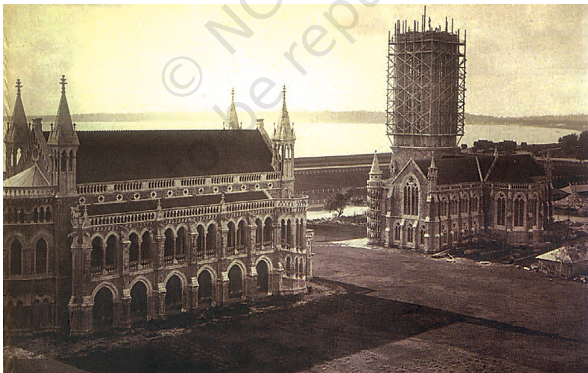
Fig. 5 – Bombay University in the nineteenth century

We must emphatically declare that the education which we desire to see extended in India is that which has for its object the diffusion of the improved arts, services, philosophy, and literature of Europe, in short, European knowledge.