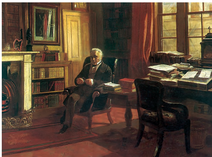
Fig. 4 – Thomas Babington Macaulay in his study