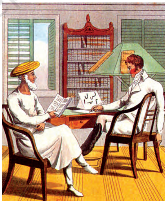
Fig. 1 – William Jones learning Persian

In 1783, a person named William Jones arrived in Calcutta. He had an appointment as a junior judge at the Supreme Court that the Company had set up. In addition to being an expert in law, Jones was a linguist . He had studied Greek and Latin at Oxford, knew French and English, had picked up Arabic from a friend, and had also learnt Persian. At Calcutta, he began spending many hours a day with pandits who taught him the subtleties of Sanskrit language, grammar and